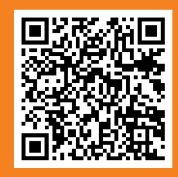
More information on your SIXT EV, instructional videos and available charging stations can be found using the QR code.

You'll notice that there is the option of 'B' Mode, which allows more rapid braking when off the throttle.